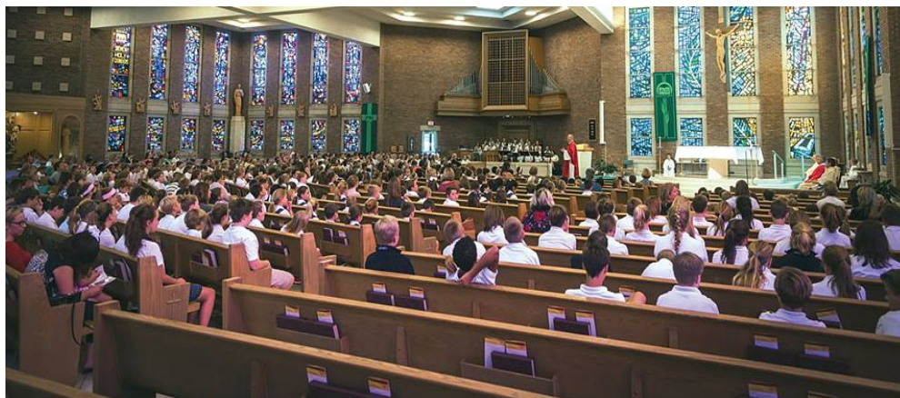
All Academy Mass at Seven Holy Founders