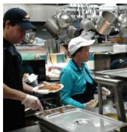
Fish Fry Volunteers