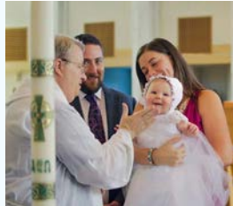
Sacraments at OLP