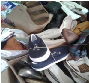
Food, shoes, clothes, toiletries, Christmas gifts fill the vestibule.

SVDP funds are raised via the Thanksgiving Day collection, memorial gifts and donations.