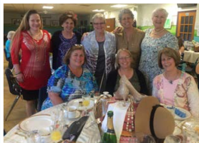
Women's League Festival of Tables Spring Event