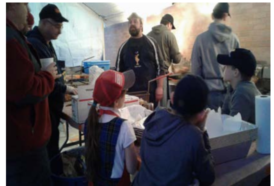
Men's Club Fish Fry with HCA School Volunteers